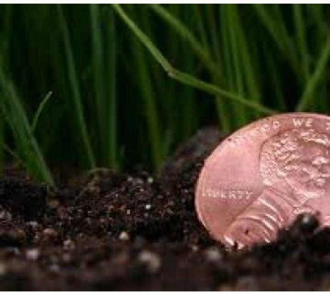
Annie dillard moth essay analysis. What is annie dillard known for. Annie dillard facts. Annie dillard the abundance review.